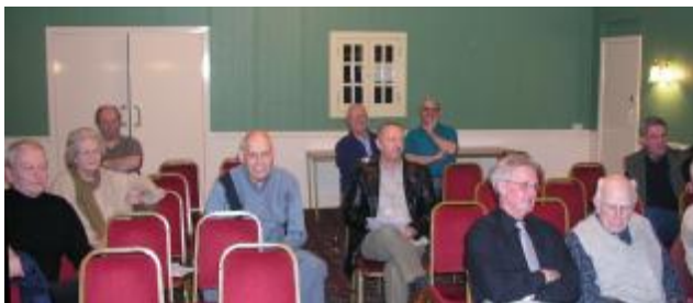
Members attending the AGM

There were no identified actions from the previous minutes.